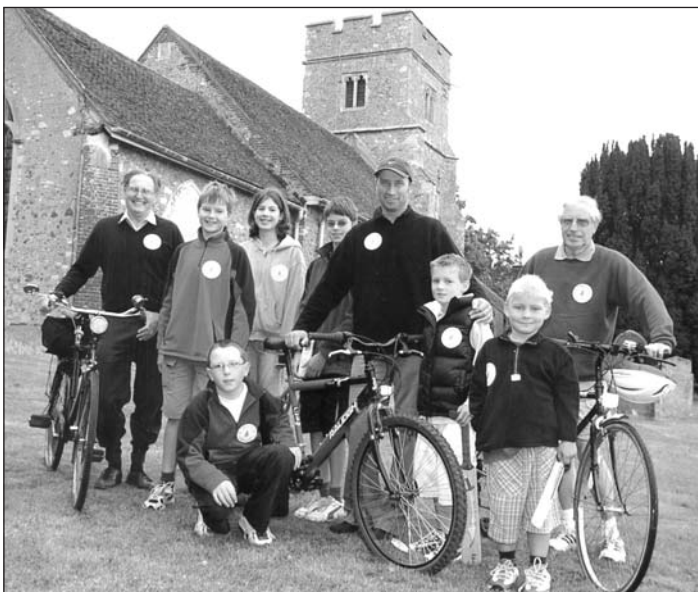
Nasser Hussain at Little Baddow launch