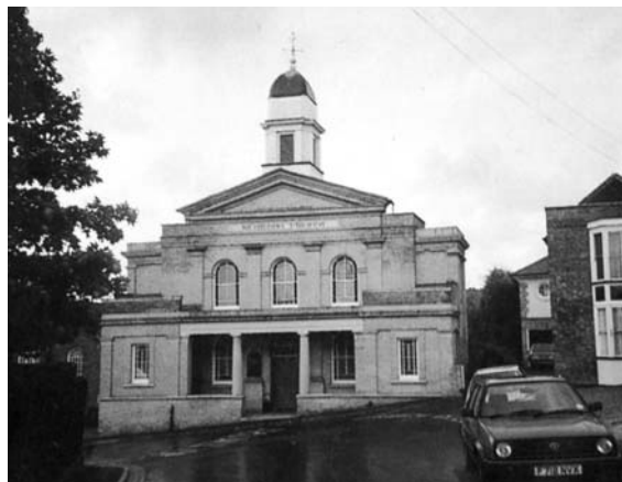
Manningtree: Methodist Chapel