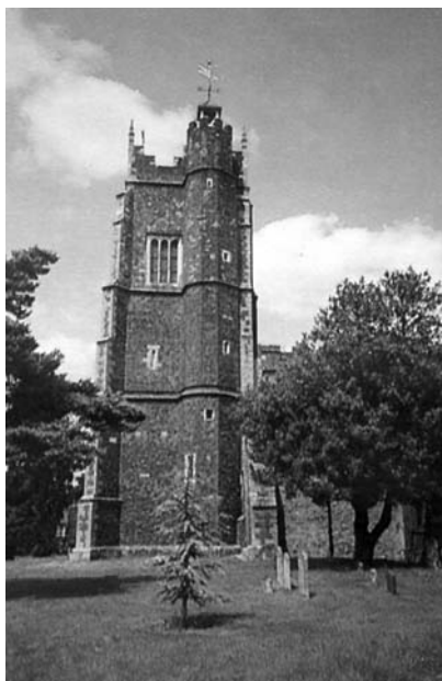
Castle Hedingham: St. Nicholas

NO VAT will be payable on repairs to listed Church buildings until March 2006. Welcome news to those parishes currently fundraising.