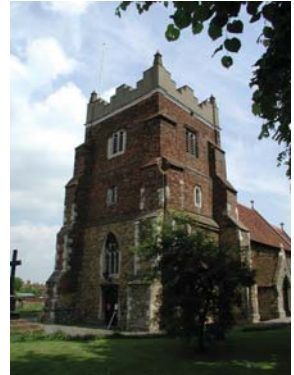
St Mary's, Tollesbury