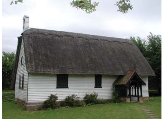
The Hamlet Church, Duddenhoe End: £1,000 for thatching

As usual the Grants Committee met on four occasions in 2011. The meetings were well attended and many thanks should be given to the Committee members and the Secretary, who all give so generously of their time. In addition to the meetings all the parishes who apply for a grant are visited by one of the Committee. The visit is arranged to discover the role of the church in the community and to gain an overall impression of the work to be undertaken. It is also an opportunity to confirm the funds available, any fund-raising activities proposed, and the expected shortfall.