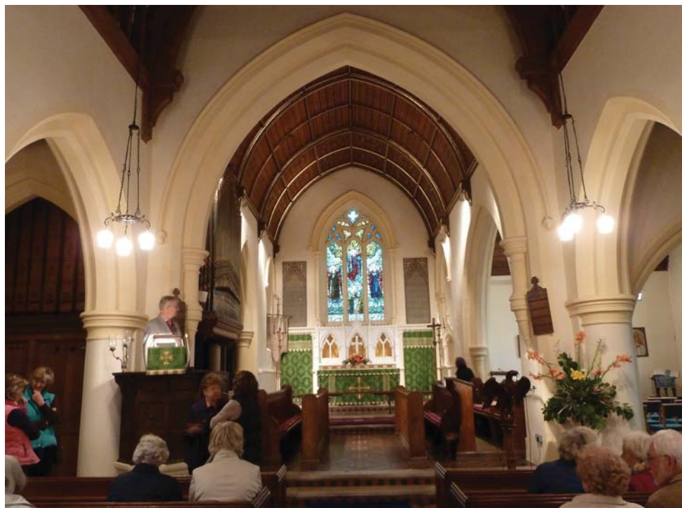
St Mary the Virgin, Matching