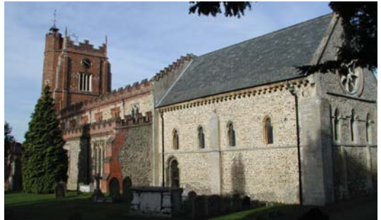
St Nicholas, Castle Hedingham: £5,000 to repair a collapsed flue

The terms of the Listed Places of Worship Grants Scheme, which allows parishes to reclaim VAT on repairs, were altered during the year, and could seriously affect larger projects. The government have set an annual ceiling figure, and each quarter HM Revenue & Customs will divide the amount of claims into the budget for the quarter, thus calculating a percentage. At the time of writing the figures for the quarter ending 30 September 2011 was just over 71%, which means that on a project of £10,000 a payment of £1,420 would be received instead of the previous figure of £2,000. It is impossible to tell whether future figures will rise or fall, and the Grants Committee are taking into account this factor when assessing applications.