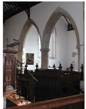
All Saints, Ashdon, looking through to the Tyrral Chapel

Then south of the Thames in September to Sir Winston Churchill country at St Mary, Westerham. A change here, for we enjoyed, again with the local W.I., a superb ploughman's lunch, including apple pie and cream. Then up to the heights of the church, with its magnificent views and access to the floral delights of the nearby village