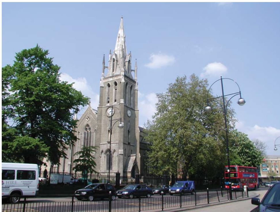
St John's, Stratford: one of the closest churches to the London Olympics, but in Essex until 1965 and still within the fold of the Friends of Essex Churches Trust