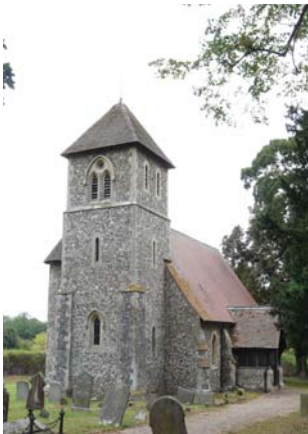
St John's, Bush End: £5,000 for general repairs

The number of grant offers in the last few years has continued to rise and 2011 was no exception, reaching a total of twenty-nine. It is still very noticeable that there are almost no applications from denominations other than the Church of England. The total amount offered was £144,000, 96% of this year's budget; the balance will be carried forward to 2012. The grants offered ranged in value from an upper limit of £10,000 down to one or two who received £1,000. As in previous years, roof repairs played a predominant part among the offers. This is not only to be expected, but is extremely important. The first principle in caring for an historic building is to keep out the weather, which can cause so much further damage.