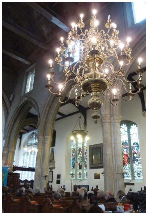
St Mary the Virgin, Hatfield Broad Oak

In May we visited three churches in the Chelmsford area. Our first stop was St Mary the Virgin, Great Baddow, a large church where the mixed use of flint and Tudor brick gives the church great visual appeal. It was here that disgruntled peasants gathered during the Revolt of 1381; the Friends were, however, in a much happier state of mind. St Mary the Virgin, Little Baddow was next, a church with two rare wooden figures of the fourteenth century which probably commemorate members of the Baddow family from the nearby Hall. After a break for lunch we moved to St Andrew, Boreham, where we examined the fine effigies of the earls of Sussex in the Radcliffe chapel. The church is also the mausoleum for the Tyrell family of Boreham House. Having concluded our Study Day we went on to the Chapel at New Hall, Boreham, where we were fortunate enough to have not only our AGM, but a talk on the building and very welcome refreshments.