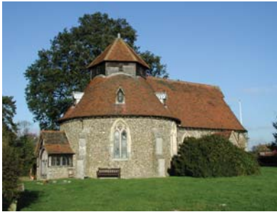
St John's, Little Maplestead: one of England's five round churches

St Giles, Great Maplestead and St John the Baptist, Little Maplestead took us in April to a delightful part of Essex, almost Devon-like, including a little short-lived driving rain! A lovely welcome? Of course, as we find at all churches visited. After an interesting talk about St Giles's we took the short run to St John's, learning much of its history before returning for our W.I. tea. Our AGM followed, where members were respectfully reminded of the slender base of their Committee upon which the future of the Branch depends.