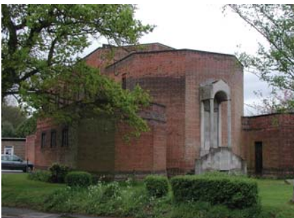
St George's, Brentwood: £10,000 National Churches Trust Partnership Grant

Lastly but most importantly, as you will see from the Treasurer's Report income for 2011 is considerably reduced, and this will affect the grant budget for 2012. The Committee will continue to assess the situation and try to meet the continuing need of parishes, and welcome applications from all Christian denominations.