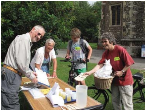
Cyclists from St Mary's, Widford signing in at Chelmsford Cathedral

Once again we were blessed with good weather for the 2011 Ride & Stride. Over 450 people were out and about riding and striding in support of the event, and at the time of FECT NEWS going to print we had raised £93,114. Whilst this figure is again down on what was raised the year before, Essex still remains one of the top county fundraisers; and St Thomas, Brentwood managed to have one of their best years ever, raising an amazing £3,536.