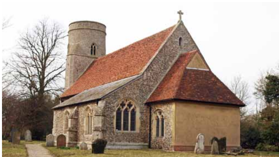
St Peter and St Paul's Church in Bardfield Saling, one of six round tower churches in Essex