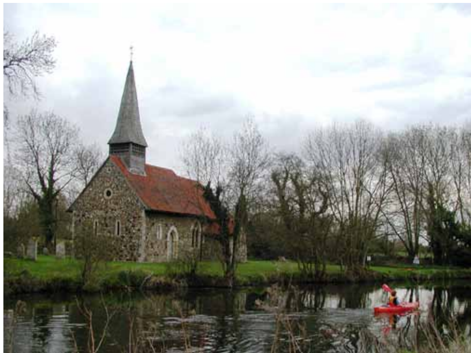
All Saints' Church in Ulting