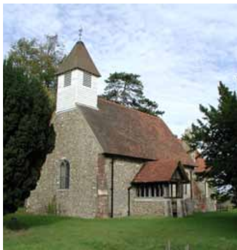
All Saints' Church in Norton Mandeville