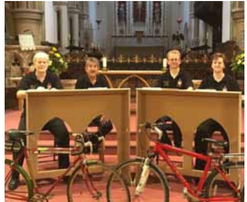
SongCycle – the ‘all cycling, all singing’ male voice quartet celebrated their 20th anniversary by singing all 150 psalms at the Church of St Thomas of Canterbury in Brentwood. They raised more than £4,200. Watch their video at http://ow.ly/6XwG309fTBN .

Despite two weeks of golden late-summer sunshine beforehand, the BBC weather forecast for 10 September 2016 was not encouraging, and the predictions of