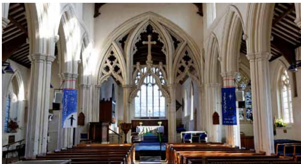
The Church of St Mary the Virgin in Stebbing. The stone rood screen is very rare.